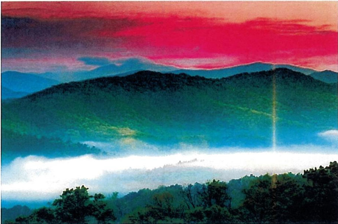
Great Smoky Mountains National Park (one of the only National Parks with no admission fee)