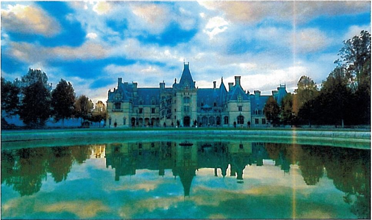
The Famous Biltmore Estate, America's Largest Home (admission fee)